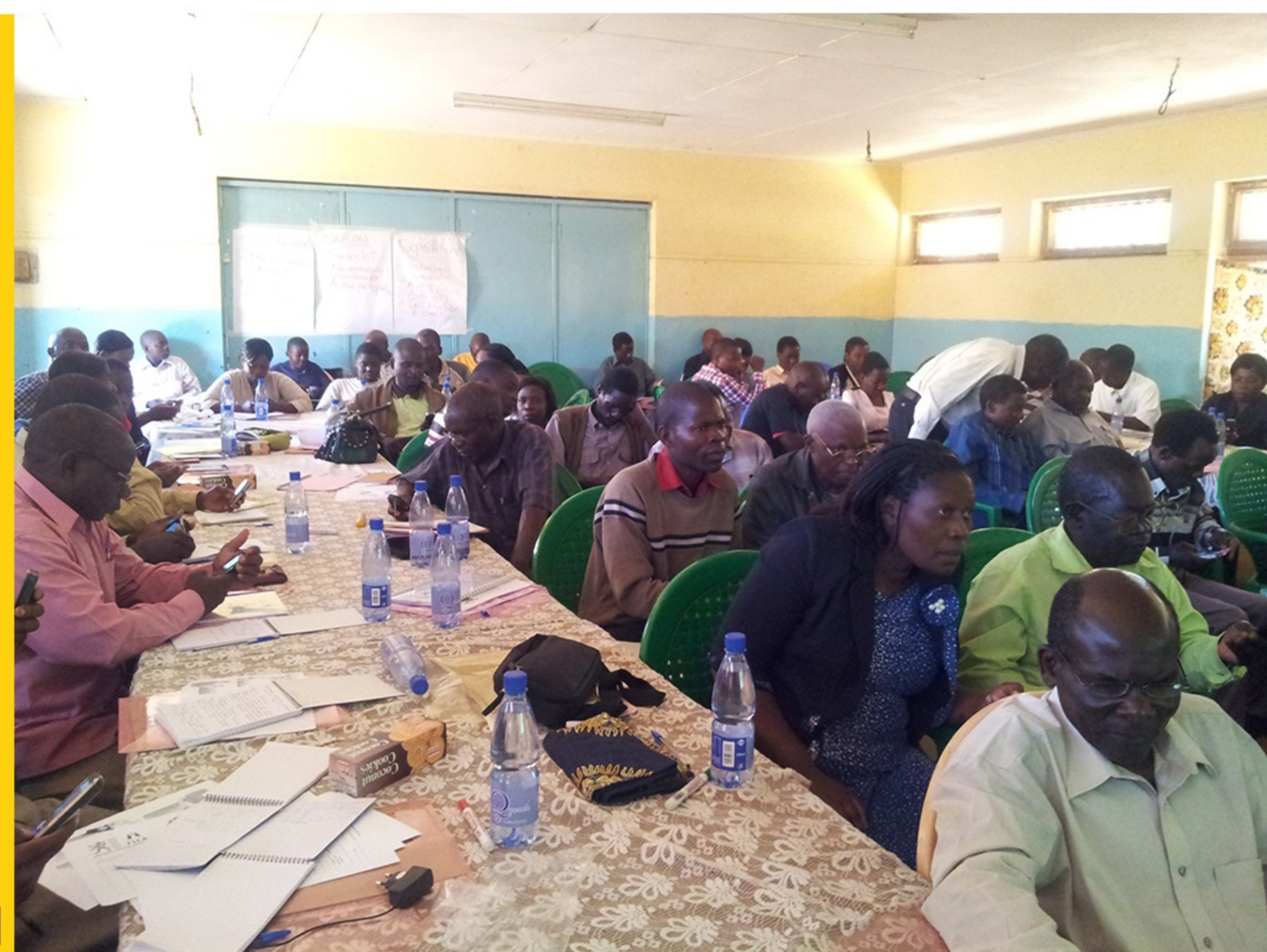
Pic 1 - 3. SMS Extension Messaging Training to Government Extension Staff.

The Government of Flanders-funded Technology for Extension to Smallholders (TEXTS) project is supporting the Government of Malawi's (GOM) Department of Agriculture and Extension Services (DAES) to improve food security and smallholder returns from agriculture by improving the quality and reach of agricultural extension through the use of SMS technology. DAES is working in partnership with Agribusiness Systems International (ASI).